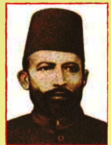
Hakim Ajmal Khan