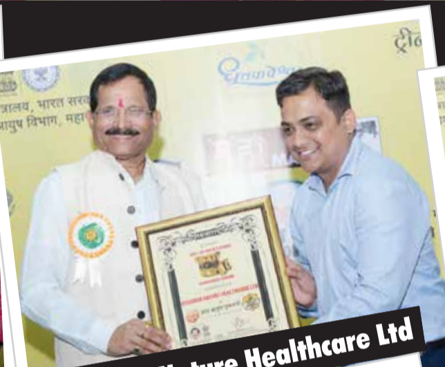
Atharva Nature Healthcare Ltd