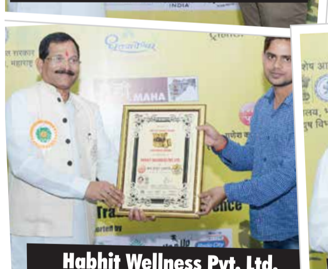
Habhit Wellness Pvt. Ltd.