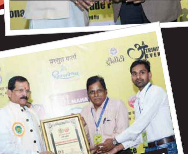
National Medicinal Plants Board