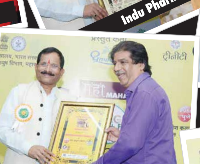
Ayurveda Rasashala Foundation