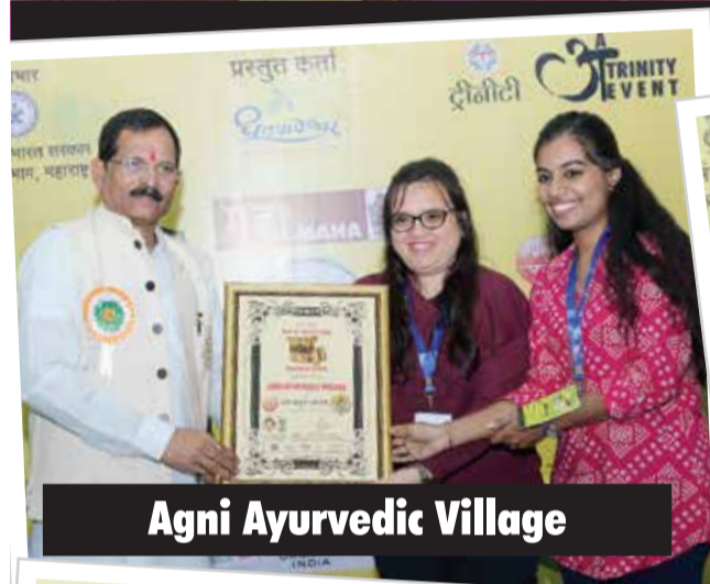
Agni Ayurvedic Village