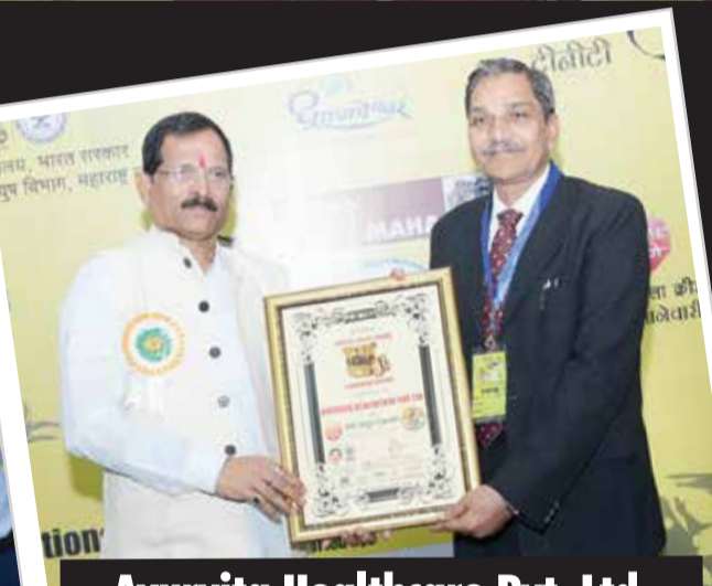
Ayurvita Healthcare Pvt. Ltd.