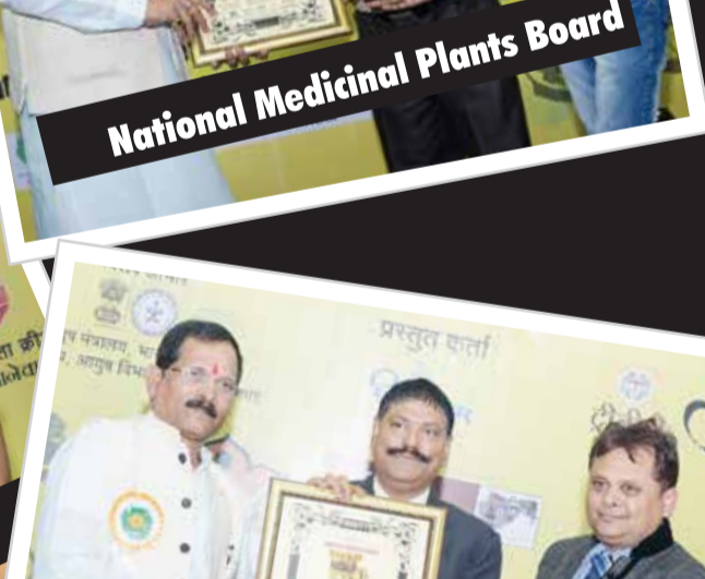
Rex (U & A) Remedies Ltd