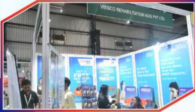
VISSCO REHABILITATION AIDS PVT LTD