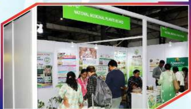
NMPB - NATIONAL MEDICINAL PLANTS BOARD, GOVT. OF INDIA