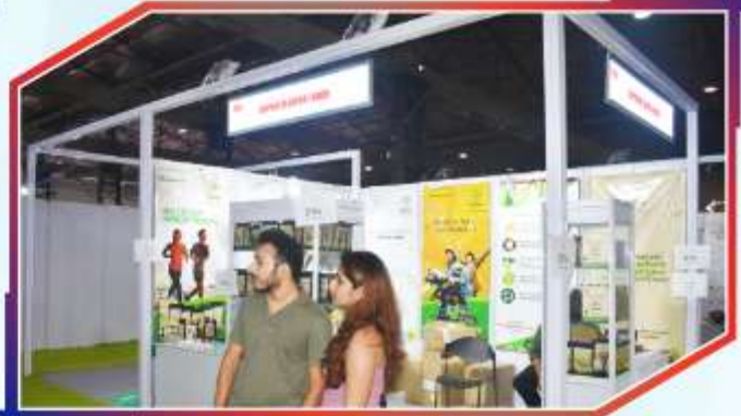
SUPREEM SUPER FOODS