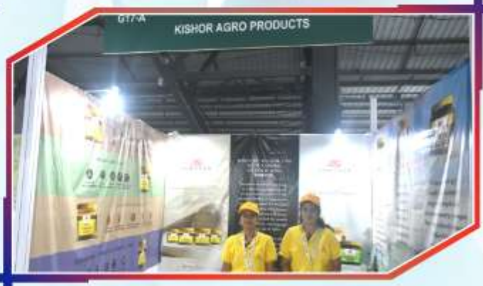
KISHOR AGRO PRODUCTS