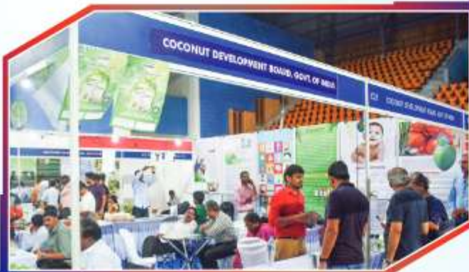
COCONUT DEVELOPMENT BOARD, GOVT. OF INDIA