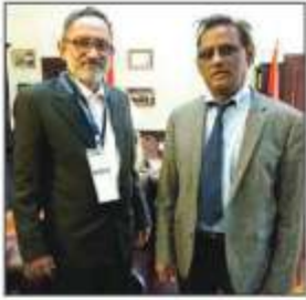
President of Mauritius & CMD of Impex Chamber