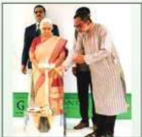
H. E. Dr. Smt. M Sinha, Governor of Goa