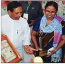
Sri Lankan Minister & Kerala Health Minister