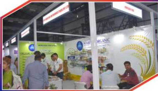
HIMALAYAN BIO ORGANIC FOODS / NIMBARK FOOD