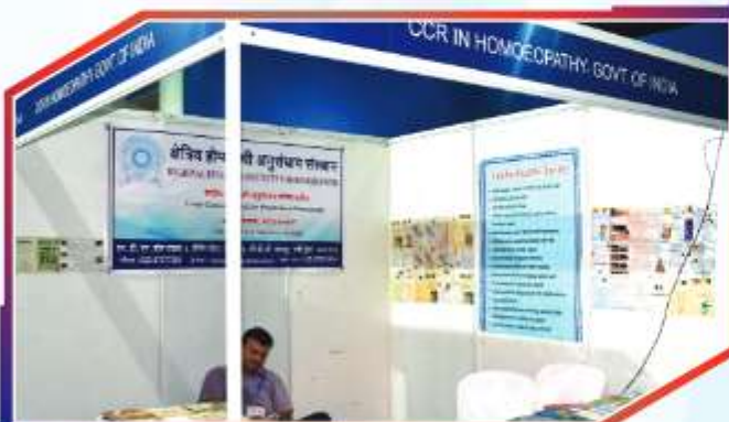
CCR IN HOMEOPATHY, GOVT. OF INDIA