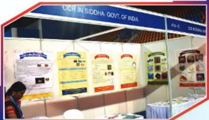
CCR IN SIDDHA, GOVT. OF INDIA