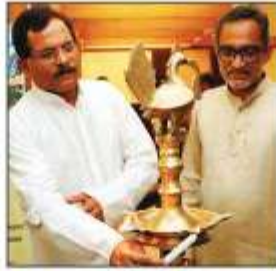
India's Minister Shripad Naik lighting the traditional lamp