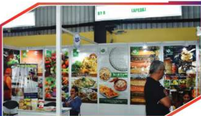
APEDA Pavilion - Agricultural Products Export Dev. Authority, Ministry of Industry & Commerce