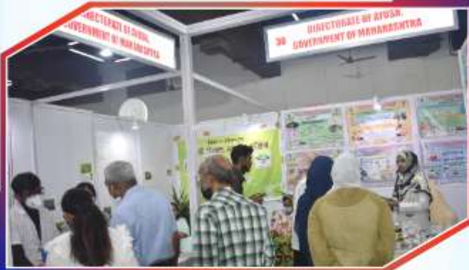
DIRECTORATE OF AYUSH, GOVT. OF MAHARASHTRA