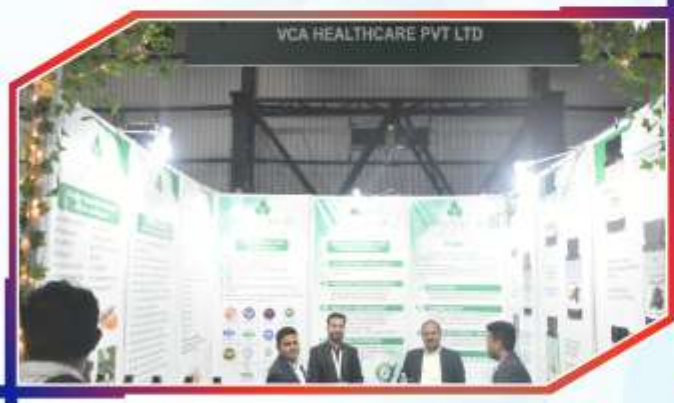
VCA HEALTHCARE PVT LTD