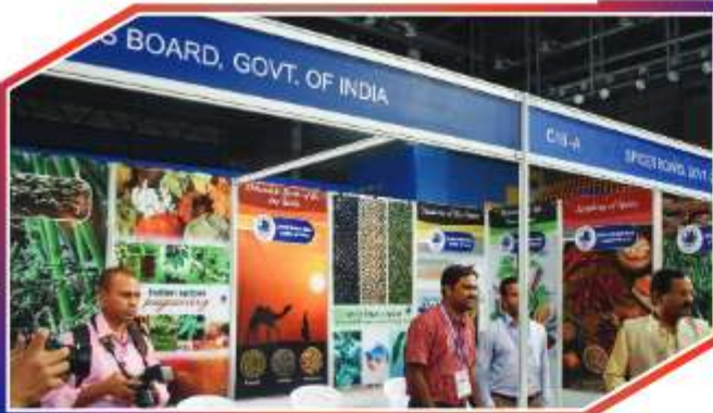
SPICES BOARD, GOVT. OF INDIA MINISTRY OF COMMERCE & INDUSTRY