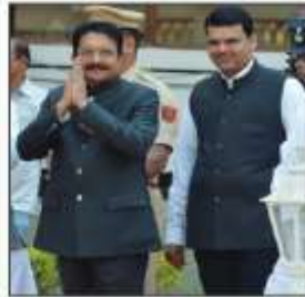
H. E. Governor Rao & CM Fadnavis of Maharashtra