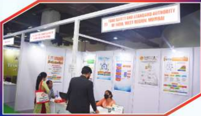
FOOD SAFETY & STANDARD AUTHORITY OF INDIA