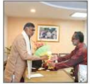
India's Minister PS Patel presented floral tributes