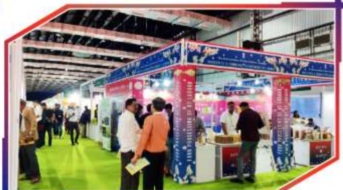
FOOD PROCESSING OF UT LADAKH