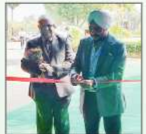
Hotels & Restaurants Association President

* All designations are of when the VVIPs interacted with the organizers of this mega show