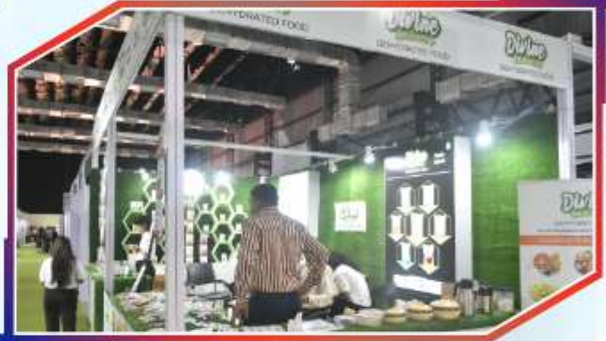
DIVINE DEHYDRATED FOOD