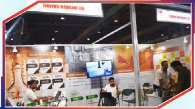
TIRUPATI MEDICARE LTD