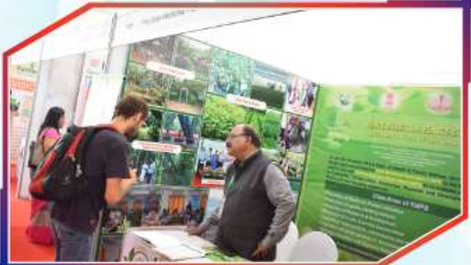
THE STATE MEDICINAL PLANTS BOARD