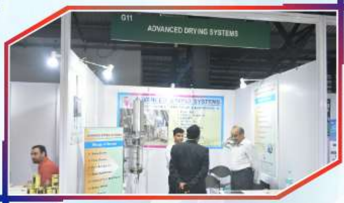
ADVANCED DRYING SYSTEMS