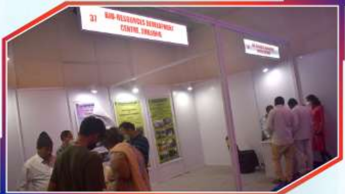
BIO-RESOURCES DEVELOPMENT CENTRE, SHILLONG