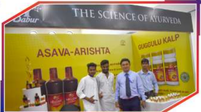
DABUR - THE SCIENCE OF AYURVEDA