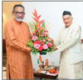
Governor of Maharashtra & Impex Chamber MD