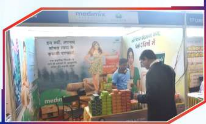
MEDIMIX AYURVEDIC CHOLAYIL