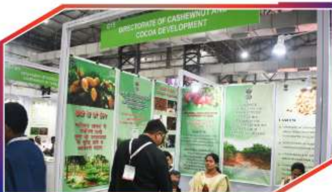
DIRECTORATE OF CASHEWNUIT & COCOA DEVELOPMENT