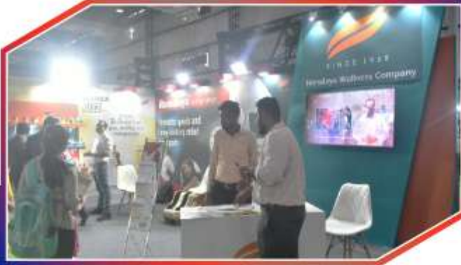
HIMALAYAN BIO ORGANIC FOODS / NIMBARK FOOD