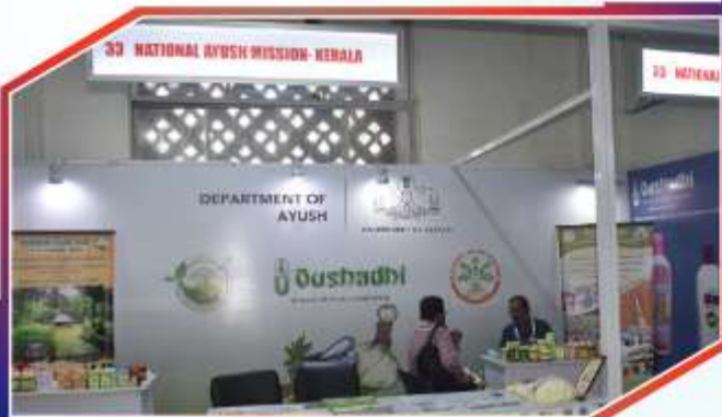
NATIONAL AYUSH MISSION - KERALA