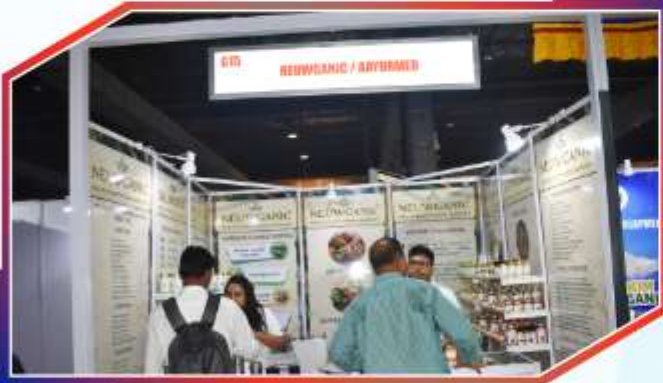
NEUWGANIC / AAYURMED