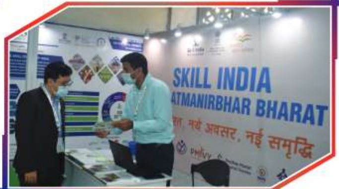
MINISTRY OF SKILL DEVELOPMENT AND ENTREPRENEURSHIP, GOVT. OF INDIA