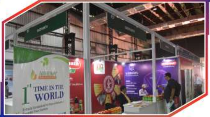
BAIDYANATH LABORATORIES LTD