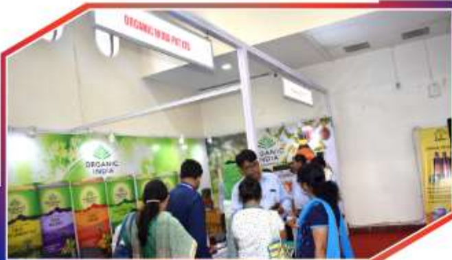
ORGANIC INDIA PVT. LTD.