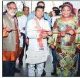
India's Minister R Teli & Congo Ambassador