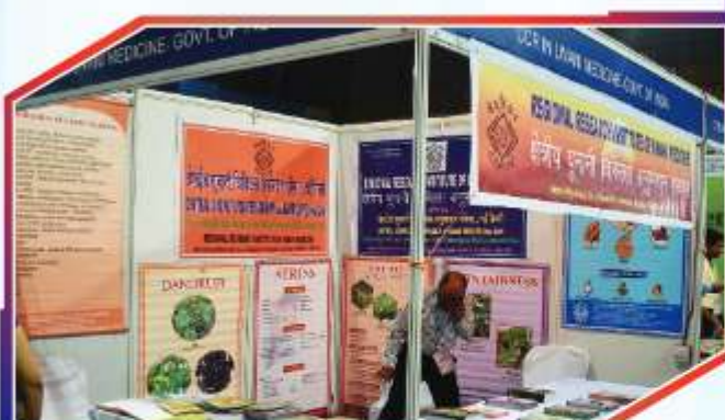
CCR IN UNANI MEDICINE, GOVT. OF INDIA