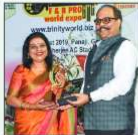
President of Goa Chamber of Commerce welcomed