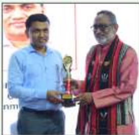
Hon Chief Minister of Goa & Impex Chamber Mg. Dir.