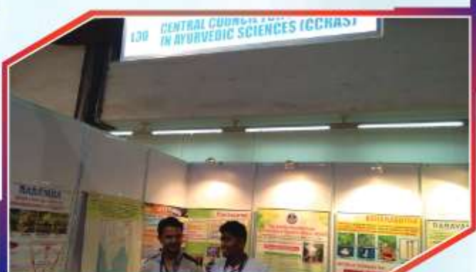
CCRAS - CENTRAL COUNCIL FOR RESEARCH IN AYURVEDIC SCIENCES, GOVT. OF INDIA