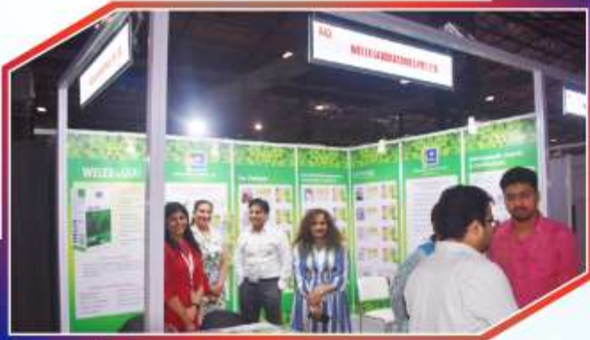
WELEX LABORATORIES PVT LTD