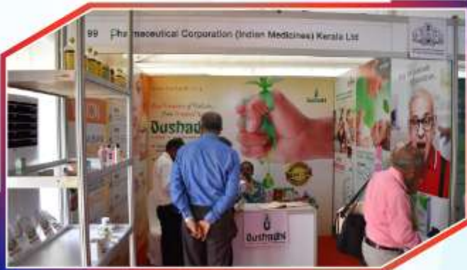
PHARMACEUTICAL CORPORATION KERALA LTD.