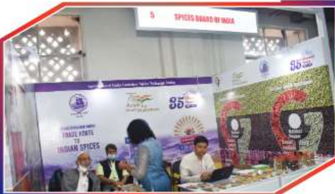
SPICES BOARD OF INDIA