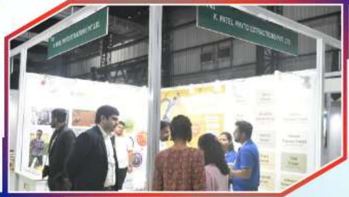
K. PATEL PHYTO EXTRACTIONS PVT LTD