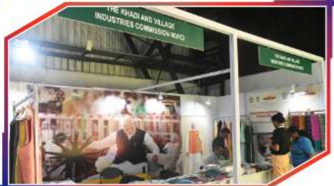
THE KHADI & VILLAGE INDUSTRIES COMMISSION