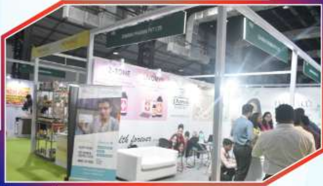
CHARAK PHARMA PVT LTD