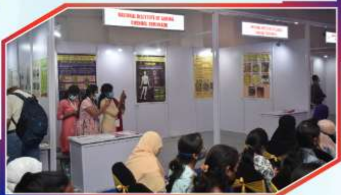
NATIONAL INSTITUTE OF SIDDHA, CHENNAI, TAMILNADU